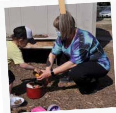
We ♥ our educators