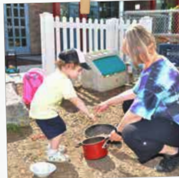
Exploring the outdoor classroom!