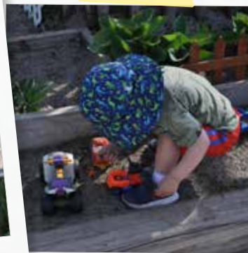
Trucks & more!